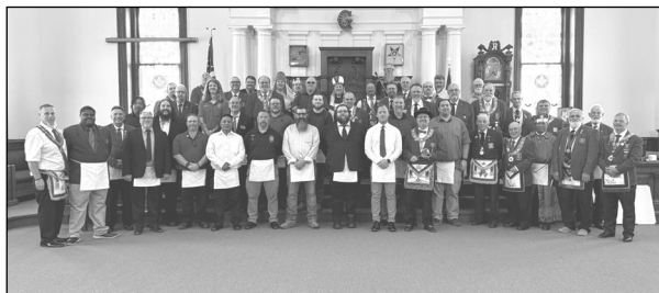
The Final GM Class RAM Class Held in Newton

attend, and experience the wisdom, beauty, and knowledge held within the caputular degree system.