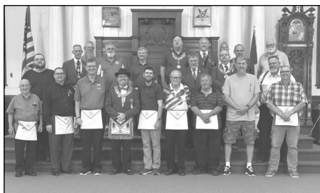
The Special Communication in Newton

The degree conferrals at Newton were done quite well, and it was a wonderful day of caputular masonry for those who were fortunate enough to attend. There were 17 new Companions of the Holy Royal Arch at the Grand Master's Classes. The Grand Master himself received the final two degrees of caputular masonry, that of the Most Excellent Master and the Holy Royal Arch,