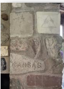
Polished stone from a Kansas scenic drive