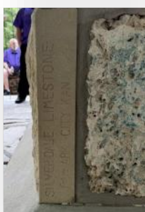
Silverdale Quarry stone

The marker is a wonderful testament to what we as Masons can do when we work together for our beliefs in equality, morality, charity, and brotherhood.