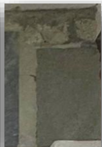
The 3 small stones at the top are from the Kaw River