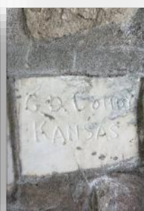
Stone from Grand Commandery of Kansas