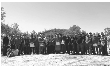
Quarry Degree attendees and the new GM class of Mark and Past Masters