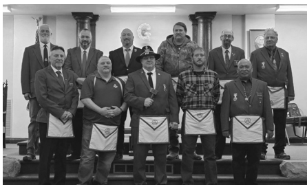
The new Mark and Past Masters and conferral teams in Russell